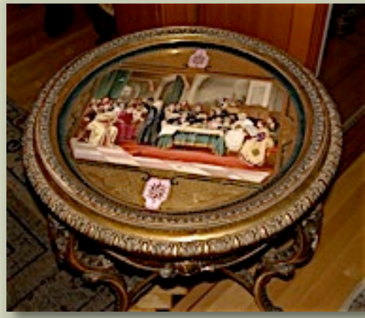
PICTORIAL PORCELAIN-MOUNTED TABLE