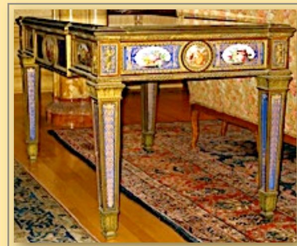
LOUIS XVI-STYLE BUREAU PLAT with PORCELAIN PLAQUES

Lend your own personal touch – and your name – to the elegance of the Doheny Mansion by sponsoring the restoration of one of these unique period pieces.