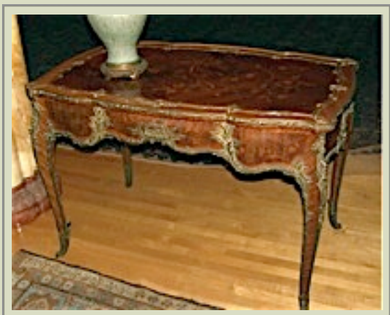
ROCOCO-REVIVAL BUREAU PLAT

A masterpiece of walnut and fruitwood marquetry embellished with gilt metal mounts of stylized floral swags and acanthus. The legs are mounted with caryatids – males crowned with grape leaves and females with upswept coiffure. Restoration needs: repair cracks and veneer losses as well as full restoration of metal mounts.