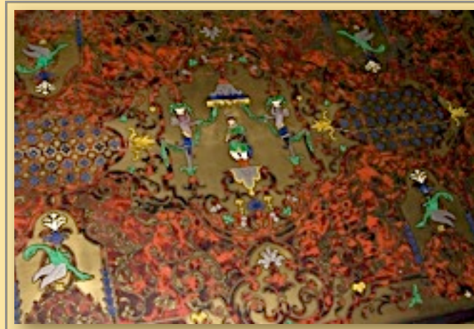
An unusual example of 19th-century Bouille technique

A favorite of Louis XIV, André Charles Bouille (1642-1732) and his family of French cabinet makers perfected the technique, which consisted of sawing through several glued-together layers of different materials, then creating designs from the resulting figures and matrices. In addition to a brass ground and ebonized wood, Bouille usually added tortoise shell, zinc, ivory and mother of pearl.