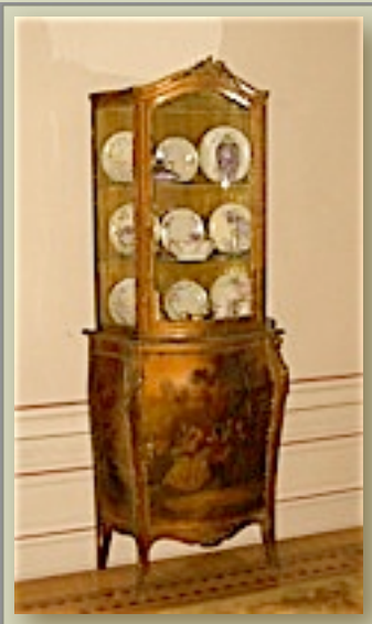
LOUIS XV-STYLE PAINTED CHINA CABINET