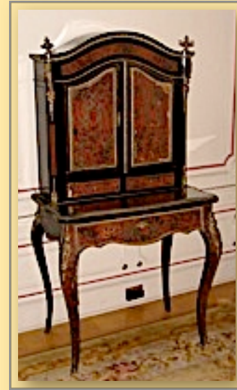
RÉGENCE-STYLE LADIES' SECRETARY

Restoration needs: in poor condition with much loss of veneer and unprofessional attempts at repair (including solder and cellophane tape).